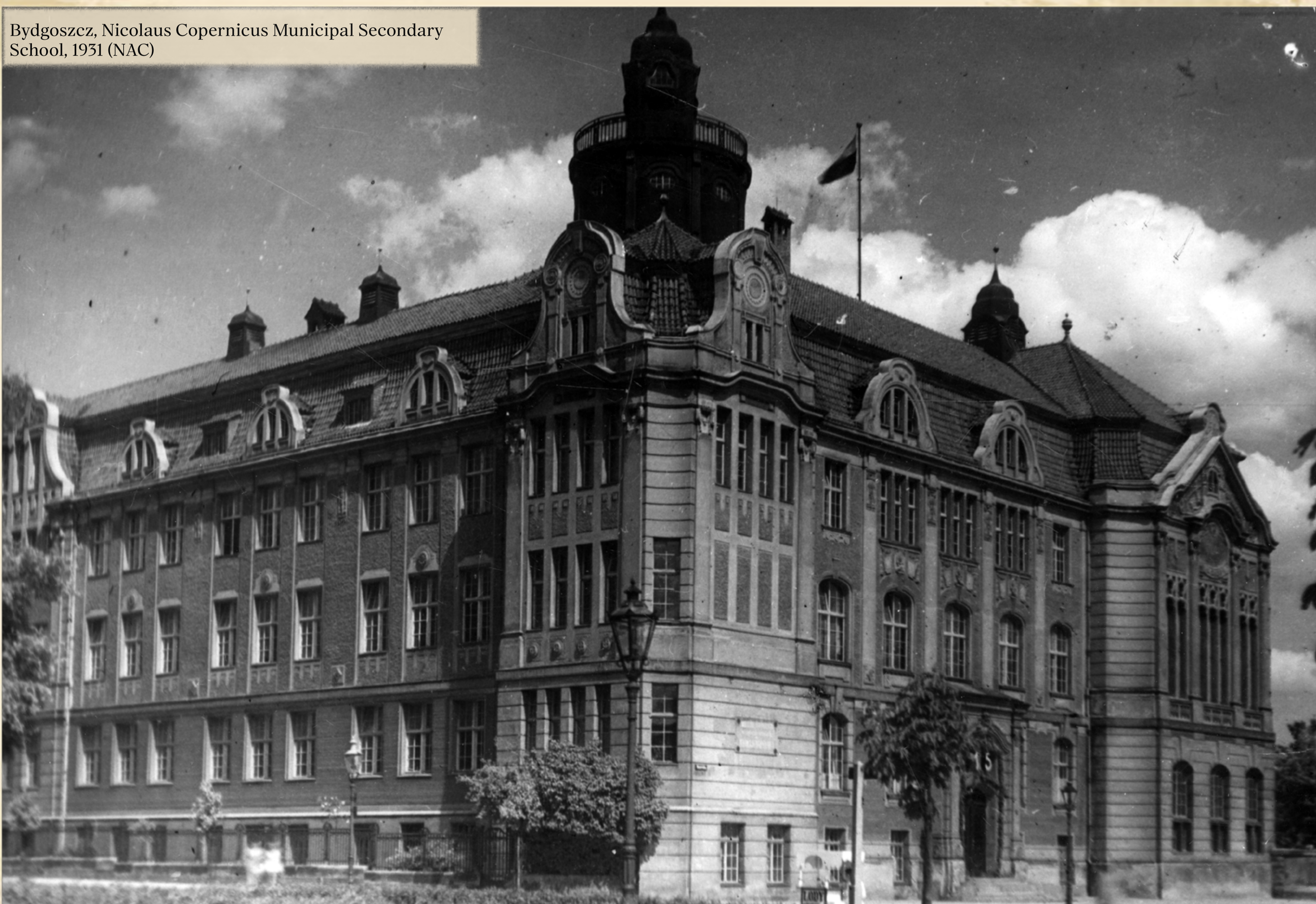
Bydgoszcz, Nicolaus Copernicus Municipal Secondary School, 1931