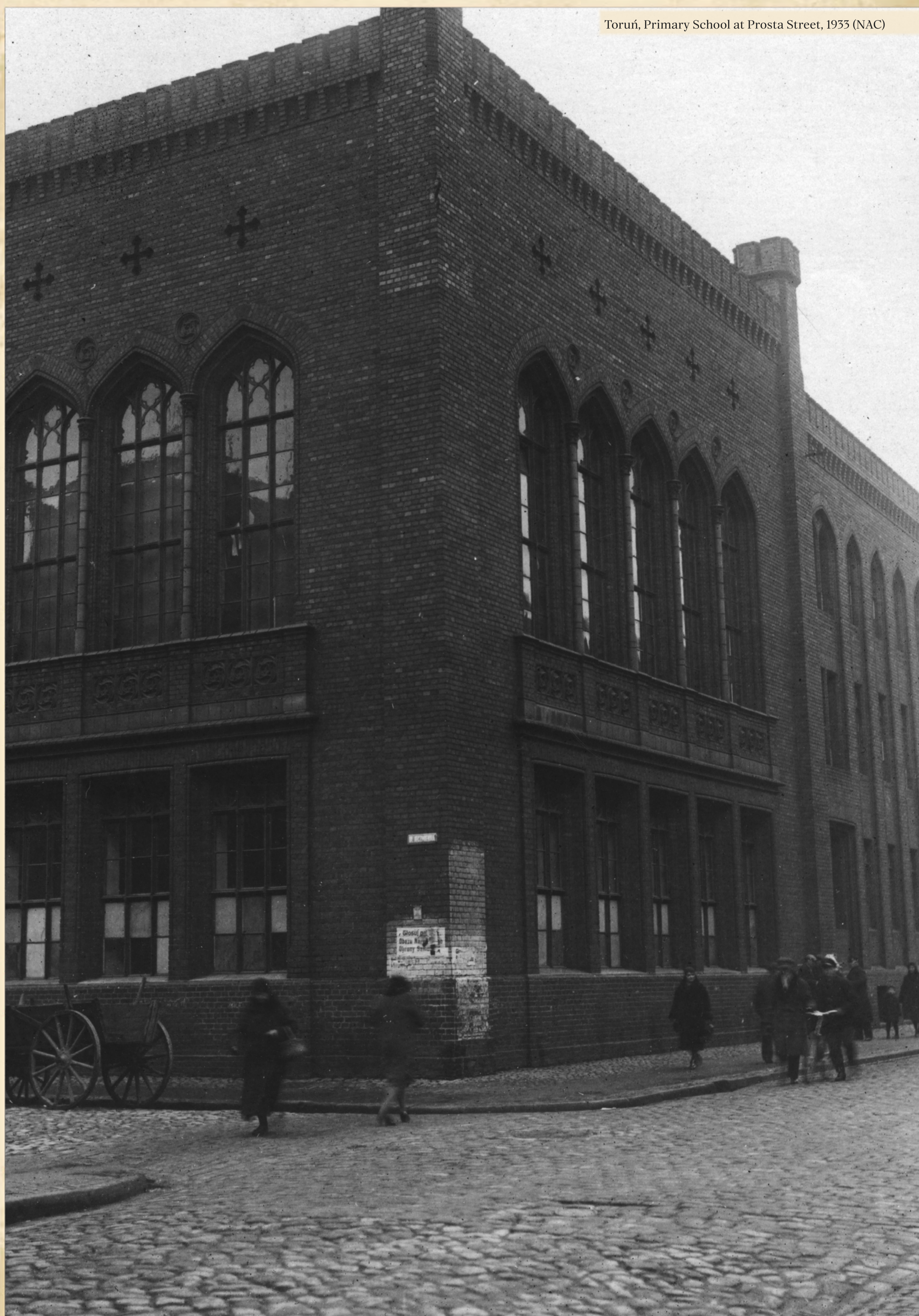
Toruń, Primary School at Prosta Street, 1935