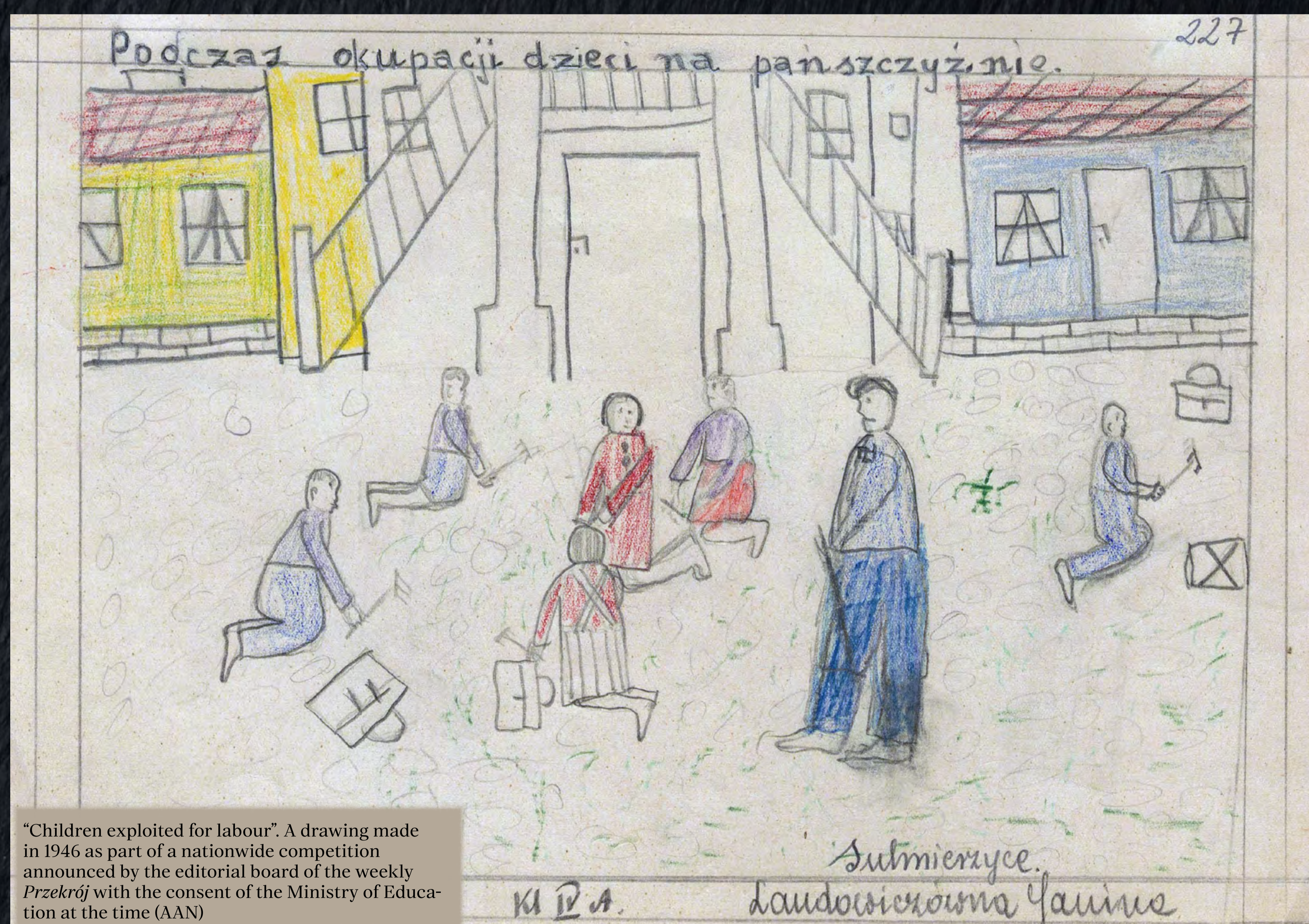
"Children exploited for labour". A drawing made in 1946 as part of a nationwide competition announced by the editorial board of the weekly Przekrój with the consent of the Ministry of Education at the time (AAN)