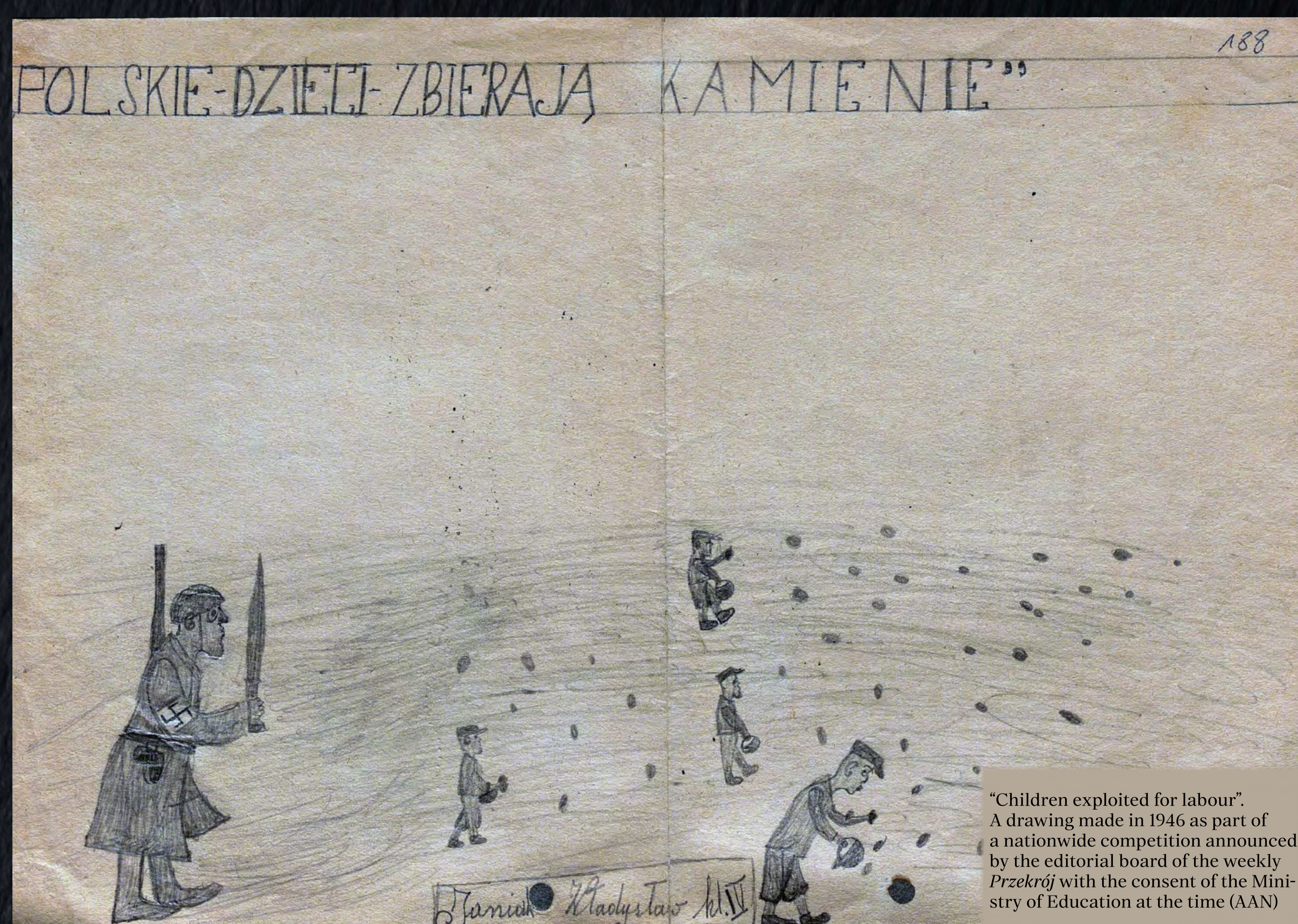
"Children exploited for labour". A drawing made in 1946 as part of a nationwide competition announced by the editorial board of the weekly Przekrój with the consent of the Ministry of Education at the time (AAN)

In the territories incorporated into the Reich, only children designated for Germanization were allowed to attend state primary schools (Volksschule). Children over the age of 14 were required to work. For those who worked on German farms, further education was practically impossible.