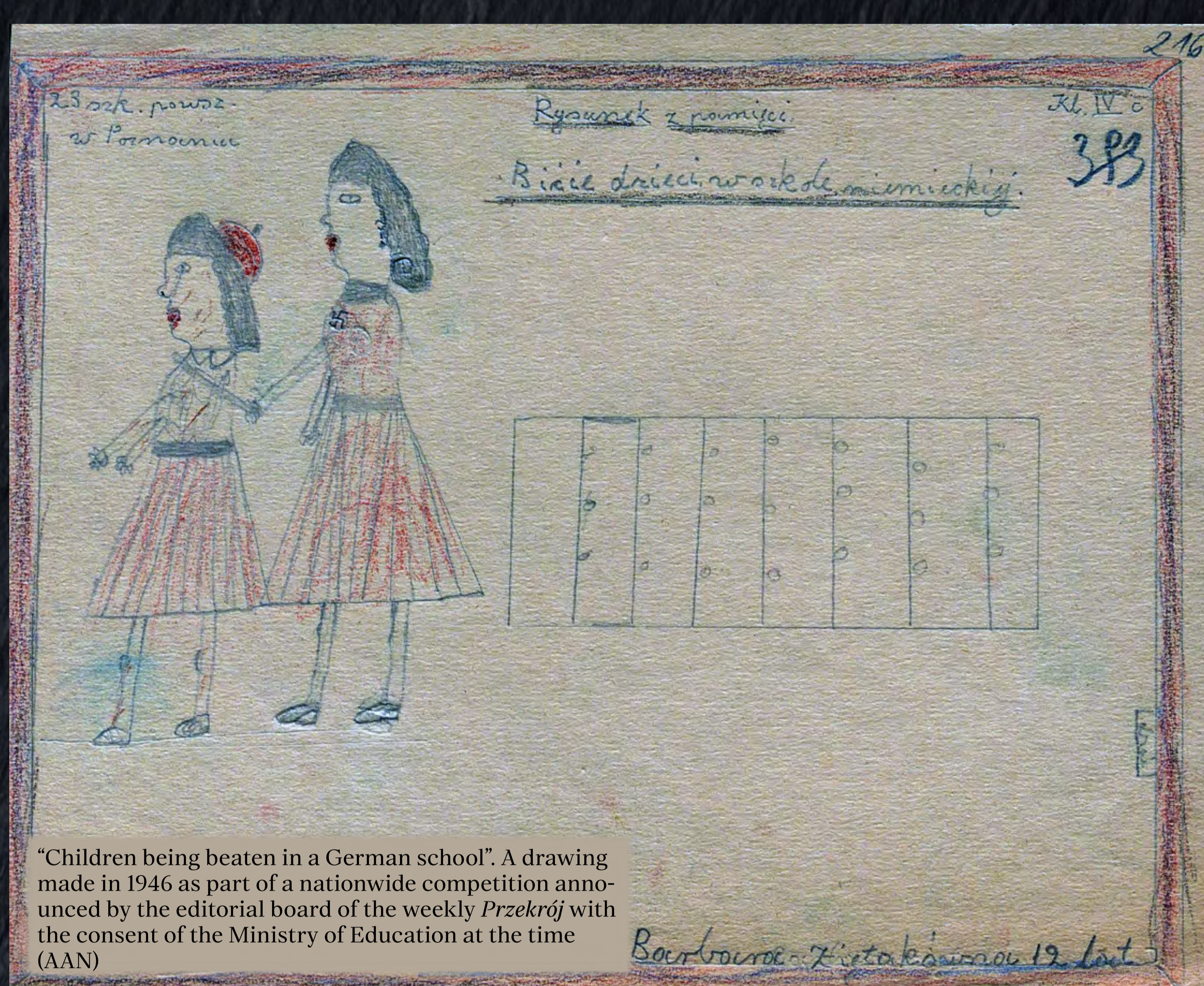
"Children being beaten in a German school". A drawing made in 1946 as part of a nationwide competition announced by the editorial board of the weekly Przekrój with the consent of the Ministry of Education at the time

In the areas incorporated into the German Reich, all Polish schools were closed, and Polish children were placed under the German educational system. On 22 September 1939, Albert Forster announced regulations governing education in West Prussia. Those regulations introduced compulsory education for children aged 6 to 14 and outlined the policy towards those Polish children who were to be Germanized.